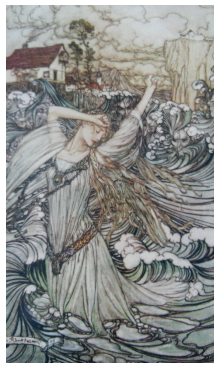
"Soon She Was Lost to Sight in the Danube."

While at the Baldwin Library, I immersed myself in fifty firstedition books illustrated by Rackham. Some were popular titles, such as Fairy Tales of the Brothers Grimm, Gulliver's Travels into Several Remote Nations of the World, Aesop's Fables, Peter Pan in Kensington Gardens, A Christmas Carol, Rip Van Winkle,