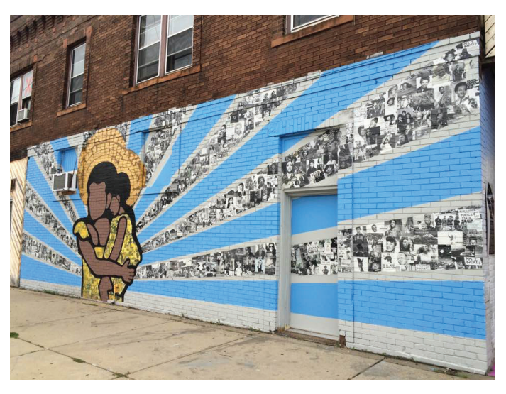
"Who We Are," a mural designed by youth and adult artists in Juxtaposition Arts' Public Art Studio. Located at 1100 West Broadway Ave. in Minneapolis, Minnesota.

You don't have to be perfect or already successful.