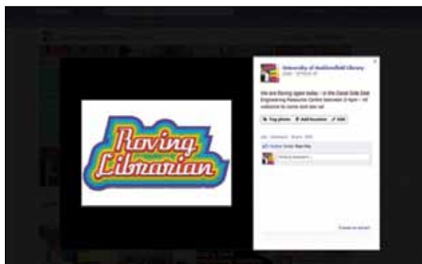
Figure 5.3 Roving Librarian session advertised on the library Facebook page.

tips and apps that may be useful, but to discuss strategies for approaching students. Initial roving sessions were rarely held by a lone librarian, but two or three were encouraged to go together. As staff became more familiar and increasingly comfortable with the roving process, this could be reduced to one staff member.