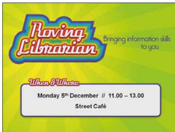
Figure 5.2 Poster advertising a Roving Librarian session in the Business School.

We dealt as much as we could with this natural reservation by using peer support mechanisms. Meetings were held not only to allow sharing of technical