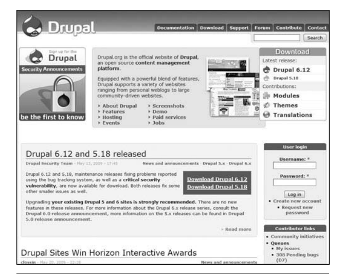
Figure 9 Drupal homepage.