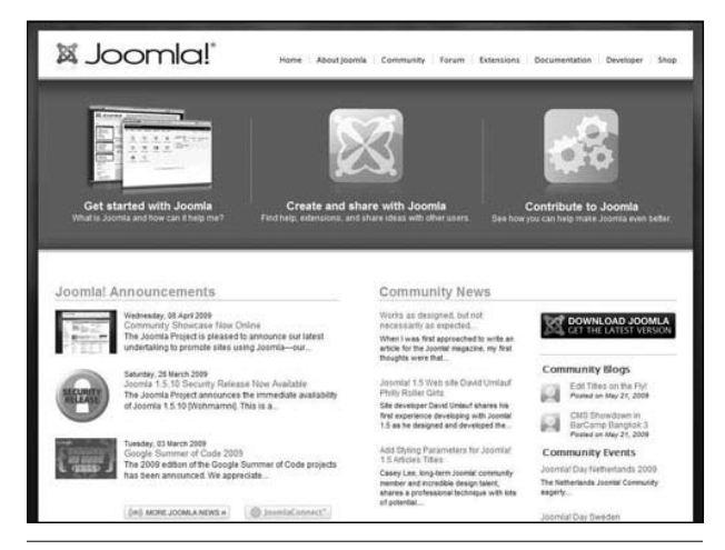
Figure 10 Joomla! homepage.