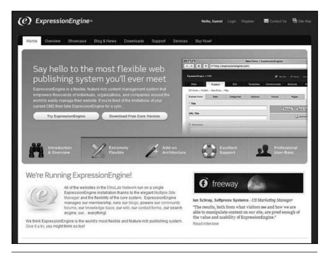
Figure 11 ExpressionEngine homepage.

ExpressionEngine www.expressionengine.com