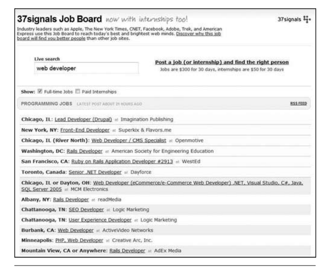
Figure 12 The 37signals Job Board.

CrunchBoard Job Board www.crunchboard.com/jobs