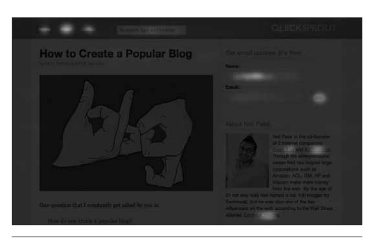
Figure 17 A heat map image created by CrazyEgg that overlays the web page to illustrate user click locations.