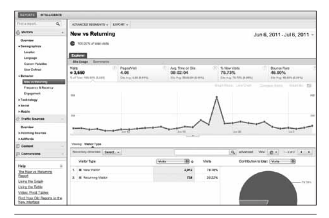
Figure 18 A screenshot of Google Analytics.

calculate the impact of the NGC. So we have to take these other factors into consideration when analyzing the impact of such a solution; however, in order to provide empirical evidence, we must, as physicists say, "ignore wind resistance."