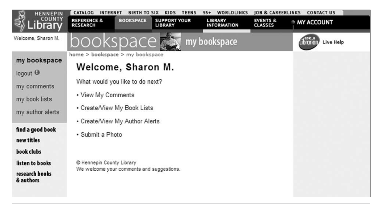
Figure 14 Personalized "My bookspace" page on Hennepin County Library's BookSpace.

Hennepin County Library's BookSpace www.hclib.org/pub/bookspace