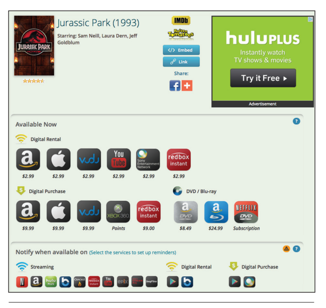
Figure 4.1 CanIStream.it? results screen for a search for the film Jurassic Park

Public libraries are experimenting with device loan to bring streaming services to their patrons. The