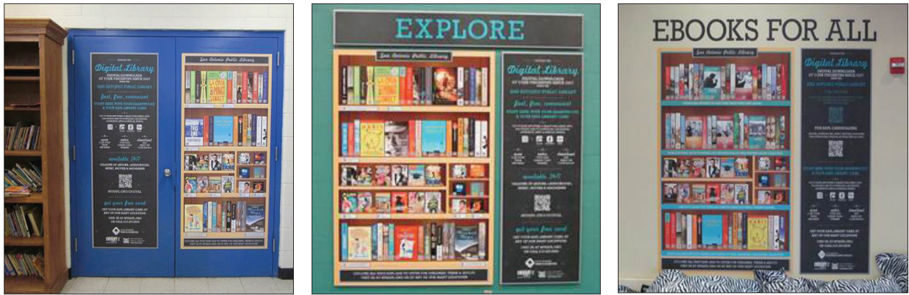
The Digital Library Community Project wallpapers serve as a gateway to San Antonio Public Library's Digital Collection. Pictured: Digital Library wallpapers at local community centers and the Henry B. Gonzalez Convention Center.

To align our message among external and internal stakeholders, we began by offering media and marketing training to our library administrative team and other library supervisors working on location with the frontline staff. The goal of the training was to encourage leadership to cultivate an environment of open communication among staff. It was important to engage the staff as our frontline advocates in the process. The marketing team worked with the library's Organizational Health Unit to support their efforts to communicate with employees. The focus of Organizational Health is to address and support the needs of SAPL employees with effective and continual communication throughout the organization; to promote creative thinking, innovation, and cohesion; and to support employees' personal career goals. Our partnership with this unit and the coupling of their mission to our own areas of focus allowed internal stakeholders to feel involved and bolstered positive attitudes. We also worked individually with members of our Board of Trustees, the San Antonio Public Library Foundation, and the Friends of the San Antonio Public Library to create targeted and succinct messages that could be shared with local leadership, donors, and others.