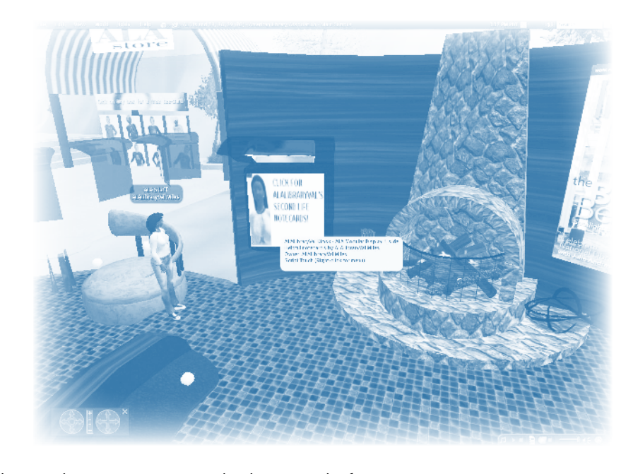
The Member Lounge on ALA Island in Second Life.

Land in Second Life can be either leased or owned, and the cost of buildings and other structures ranges from free to rather expensive. Organizations often start small by leasing a plot from another organization. For example, both